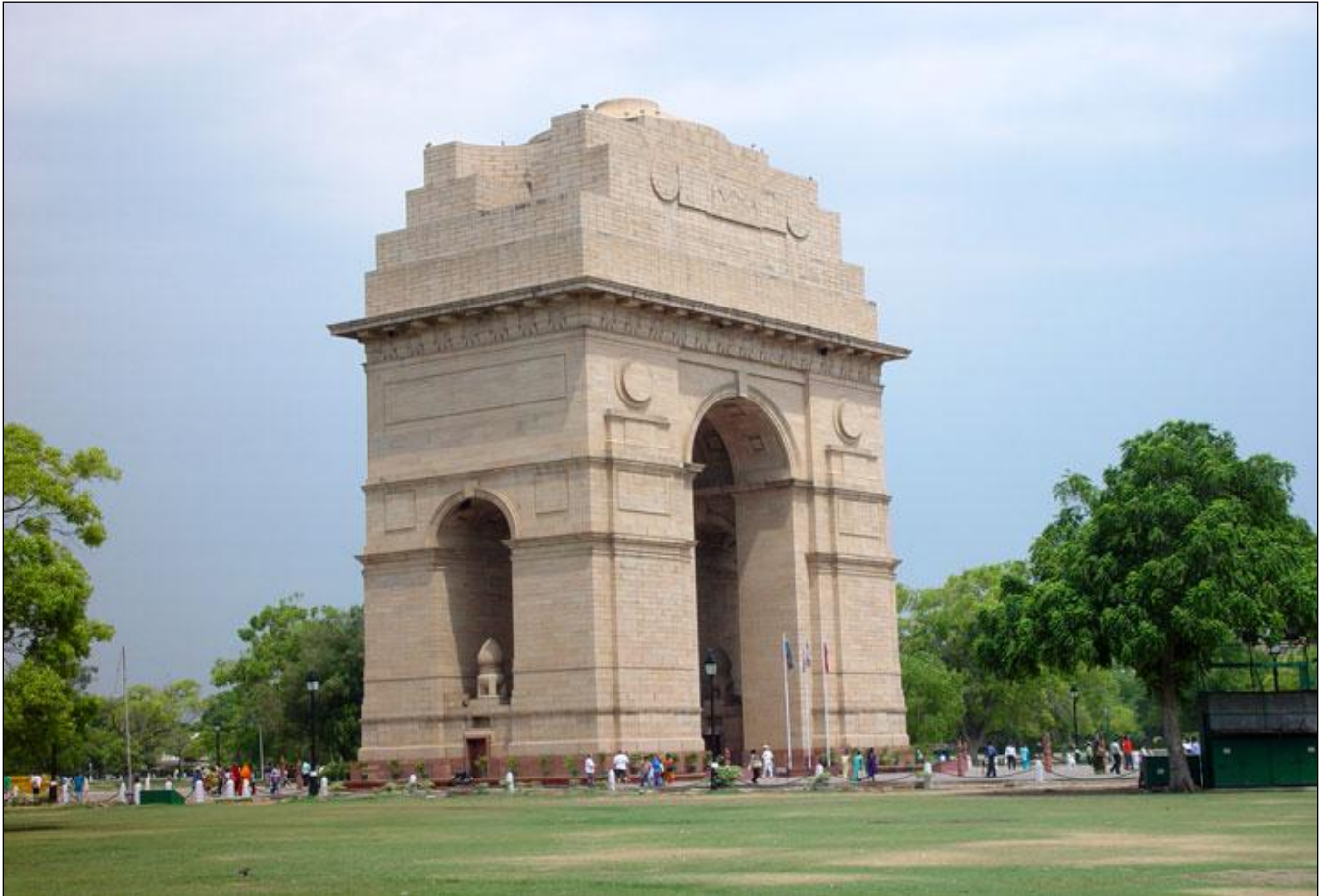
Photo Stop at India Gate - At the centre of New Delhi stands the 42 m high India Gate, an “Arc-de-Triumph” like archway in the middle of a crossroad. Almost similar to its French counterpart, it commemorates the 70,000 Indian soldiers who lost their lives fighting for the British Army during the World War I. The memorial bears the names of

more than 13,516 British and Indian soldiers killed in the Northwestern Frontier in the Afghan war of 1919. Under the arch, the Amar Jawan Jyoti commemorating Indian armed forces' losses in the Indo-Pakistan war of 1971.