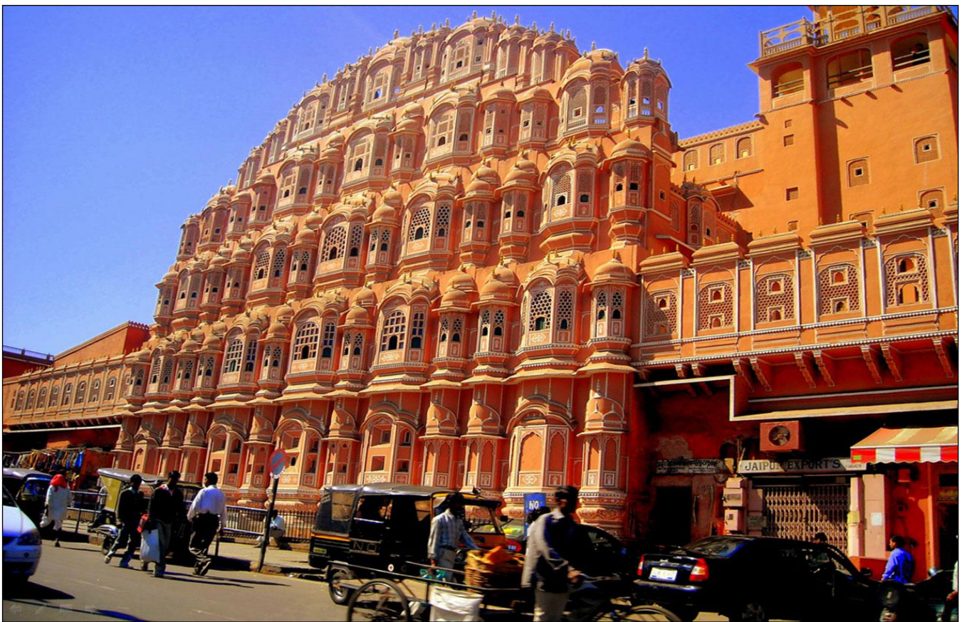
Photo Stop at Hawa Mahal Palace - The poet king Sawai Pratap Singh built this palace of winds. This is easily the most well-known landmarks of Jaipur and is also its icon. This five-storey building overlooking the busy bazaar street is a fascinating example of Rajput

architecture and artistry with its delicately honeycombed 953 pink sandstone windows known as 'jharokhas'. It was originally built for the ladies of the royal household to watch everyday life and processions in the city from their veiled comfort.